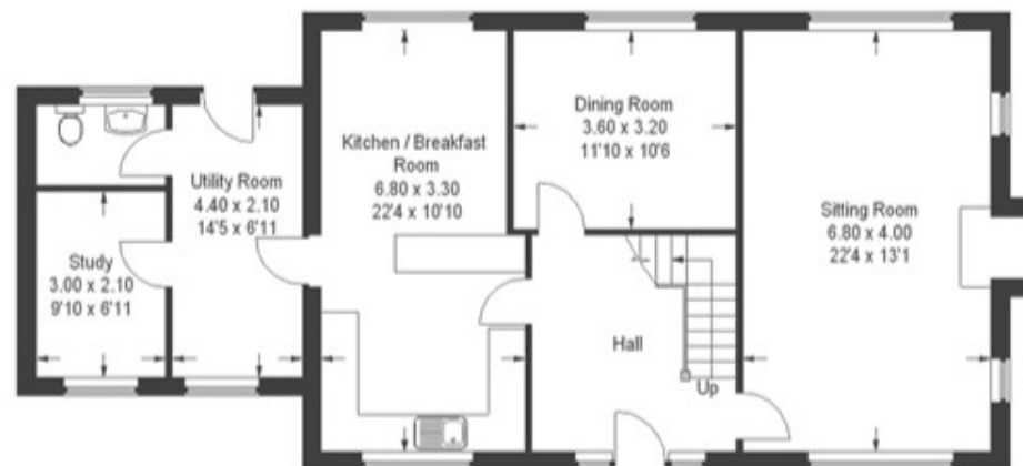
GROUND FLOOR PLAN AS EXISTING